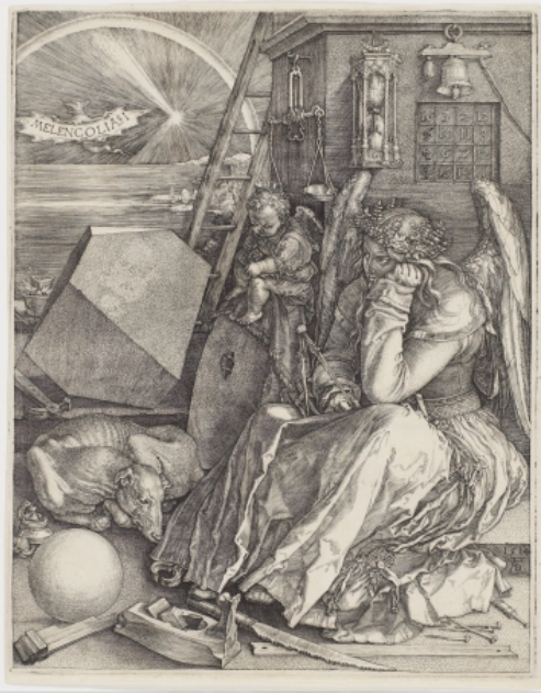
Albrecht Dürer, "Melencolia I" (1514), etching

because suddenly there's an essay-lecture-performance in the middle of an already unconventional memoir that has a Pongean explication on foamingness, and also a feminist reading of the Aphrodite myth. Your voice there comes in very clearly, making polemical judgments about art and theory and history. But the whole does still coalesce because the dog is sculpturally miming this coalescence for you: as a being that contains multitudes of genres. And the fact that the book contains multitudes of genres makes it extremely experimental, but, because of the dog-as-